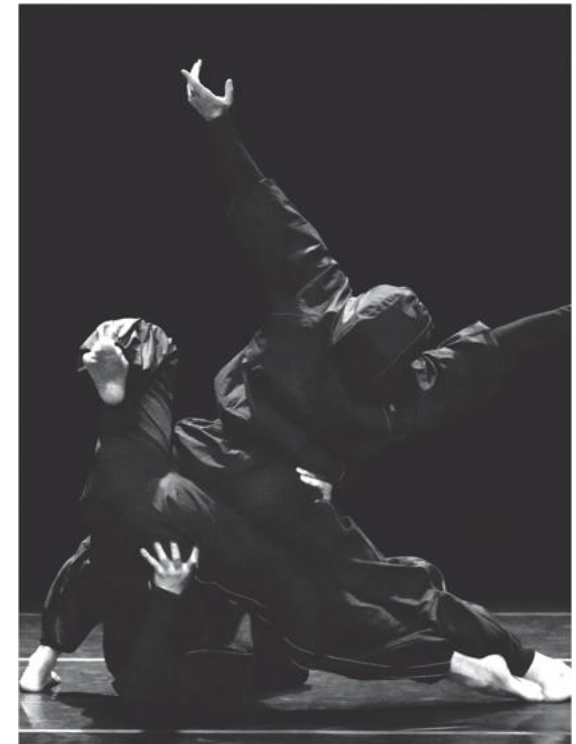
Festival'23 Artists