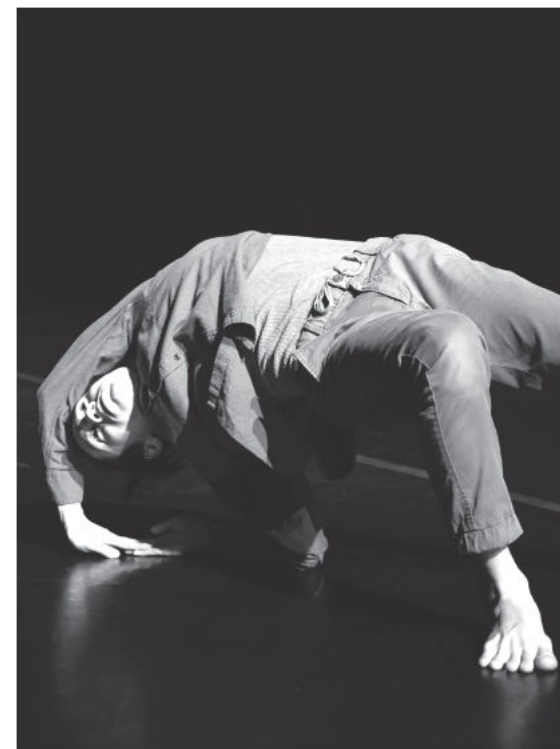
Photography: Jingzi Zhao | Festival21 Artists